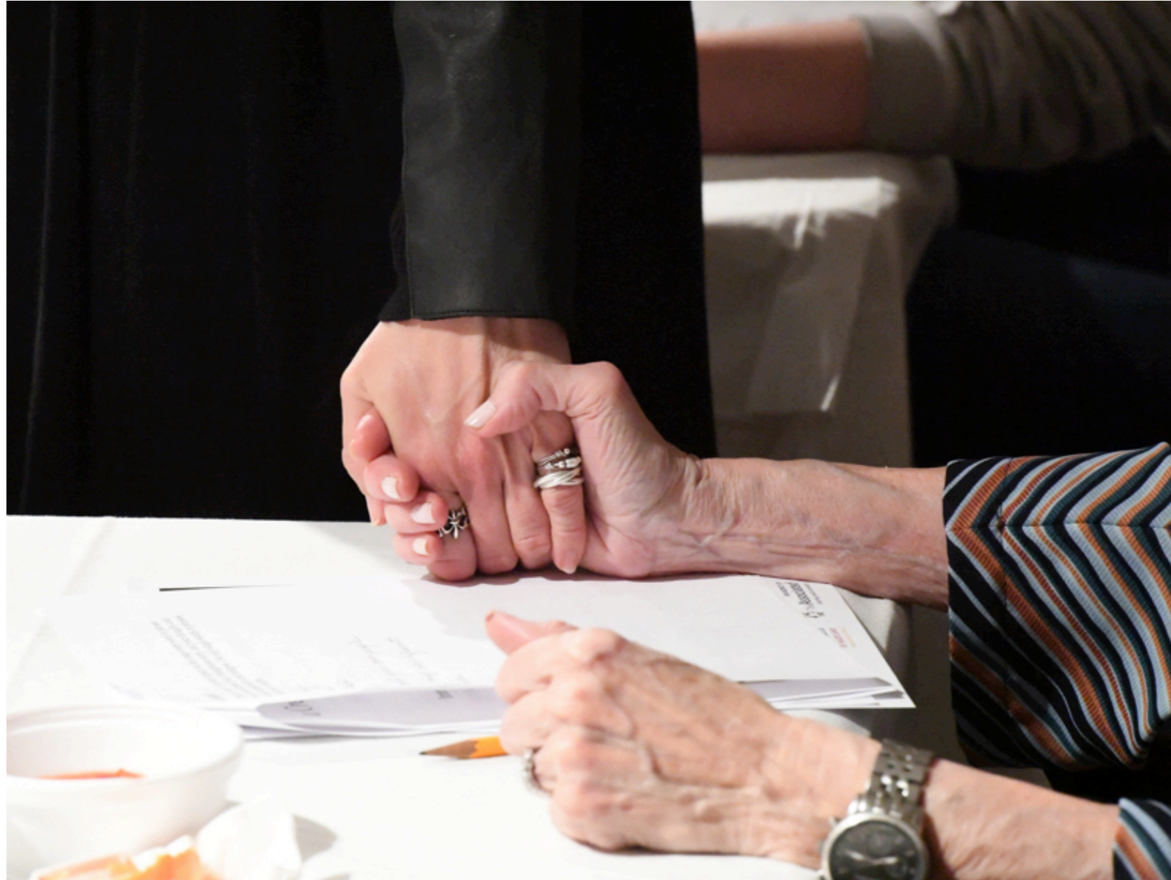
“An Explorer’s Desire” - Audience & Cast member during engaged performance