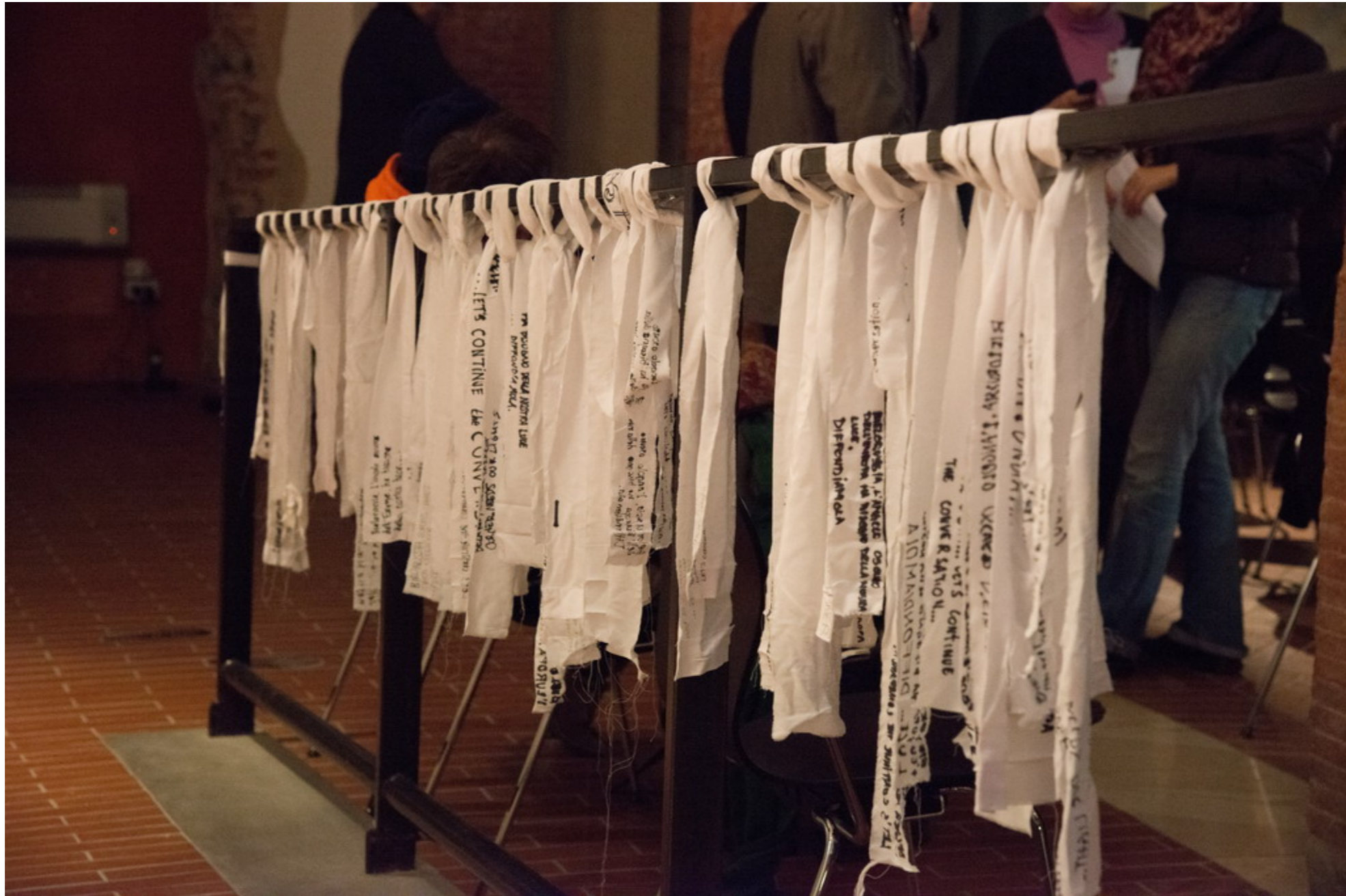
Environmental visual design for event exploring censorship in democracy (gags for audience to wear)